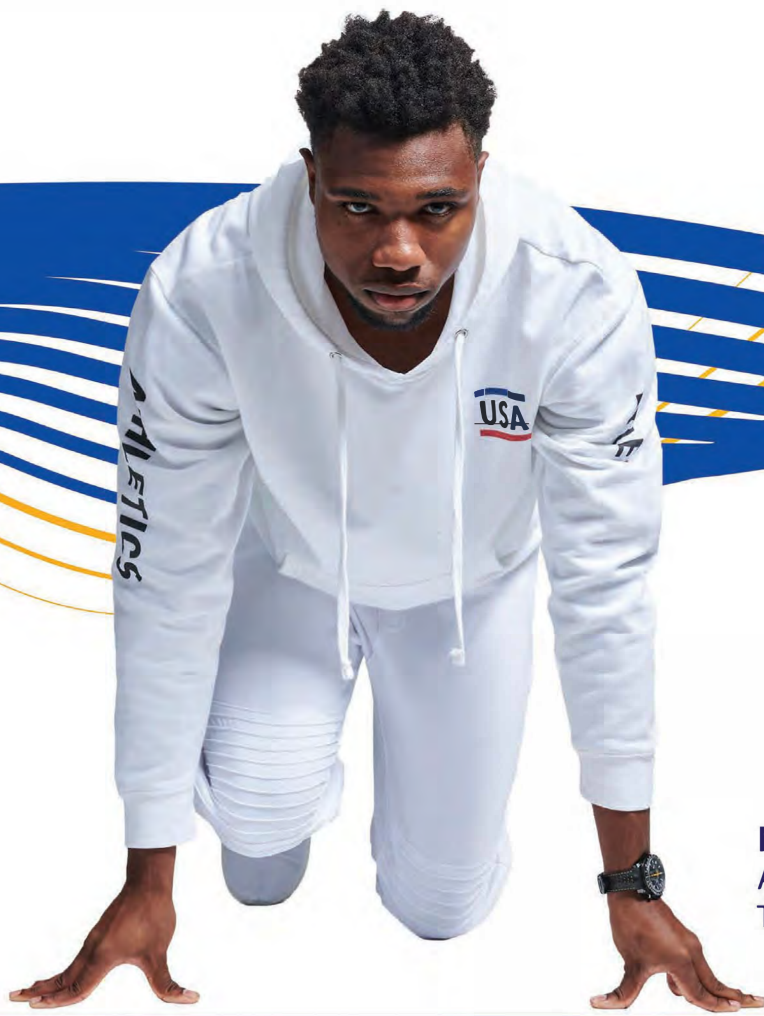
Noah Lyles Athletics Team Visa