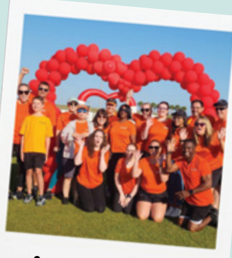
Space Coast Heart Walk