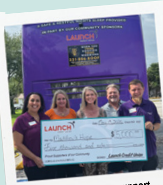
Matthew's Hope support