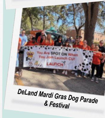
DeLand Mardi Gras Dog Parade & Festival