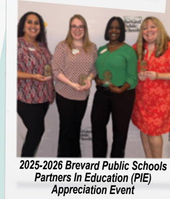
2025-2026 Brevard Public Schools Partners In Education (PIE) Appreciation Event