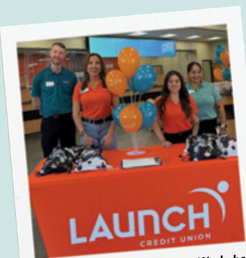
CU Youth Month – Smart Start Workshop at our Orange City branch

We're proud supporters of the Brevard and Volusia County communities. Through donations, event participation, sponsorships, scholarships, and volunteer work, our team is committed to making a meaningful impact. We're excited to share just a few of the many ways our staff gives back and helps strengthen the communities we serve.