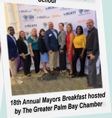
18th Annual Mayors Breakfast hosted by The Greater Palm Bay Chamber

At Launch Credit Union, community is at the heart of what we do. While we can't showcase every organization our employees have supported in the past few months, we want to celebrate some of the generous and caring team members who go above and beyond. Whether you're visiting a branch, calling in, or chatting online, know that you're being helped by people who care deeply about making a difference. We regularly share these stories in our monthly e-newsletter and on social media, so be sure to follow along. If you're able, we encourage you to discover what you're passionate about and lend a hand in the community. Helping others brings incredible rewards – for them and for you.