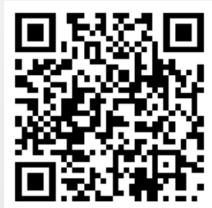
Find out all the current merger info by scanning this QR code!

Together, we're building a stronger, more resilient credit union—one that can better serve your financial needs today and into the future.