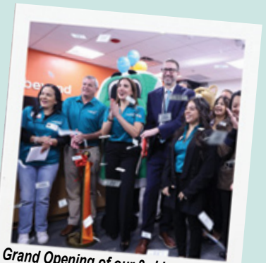
Grand Opening of our 3rd Launch CU School Branch at Pine Ridge High School